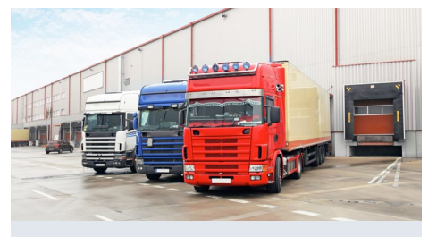
Commercial: Warehouses and lots, equipment/fleet parking