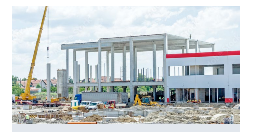
Construction: Site surveillance and perimeter security