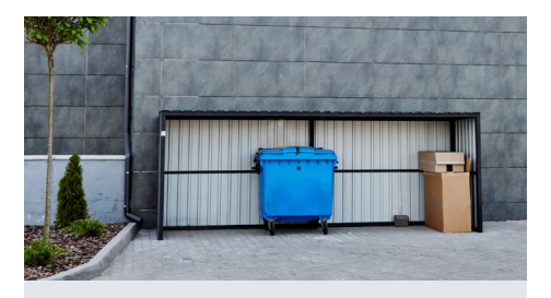
Property management: Parking lots, gates, dumpsters