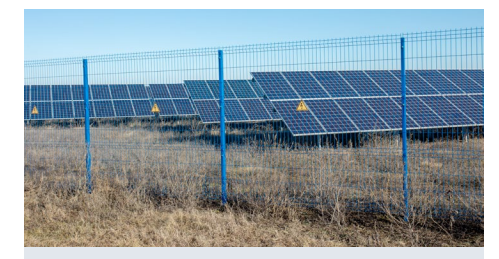
Industrial: Power infrastructure, oil and gas, water treatment facilities